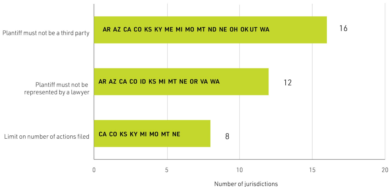
Figure 2. As of January 1, 2023, 19 states imposed one or more of these restrictions on debt collection plaintiffs' ability to file lawsuits in small claims courts.